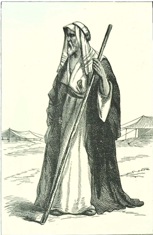
AN ARAB SHEIKH LEANING ON HIS STAFF.