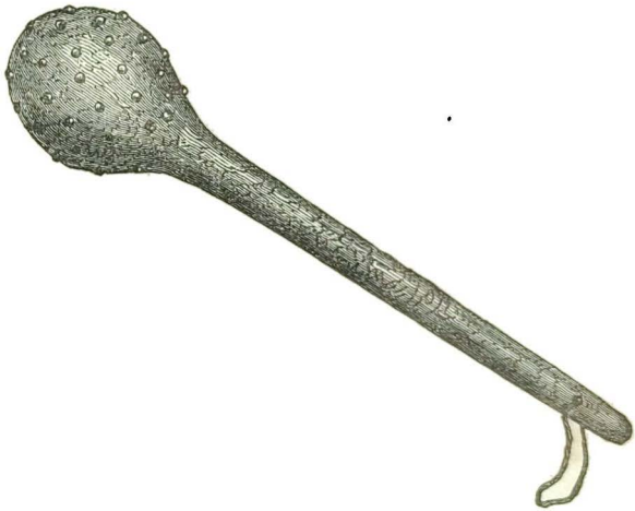
FORMS OF THE SHEPHERD'S SHAVAIT OR OAK CLUB.