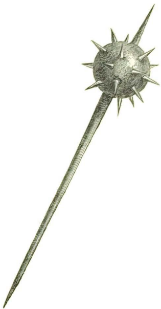
A DERWEEH'S IRON MACE.