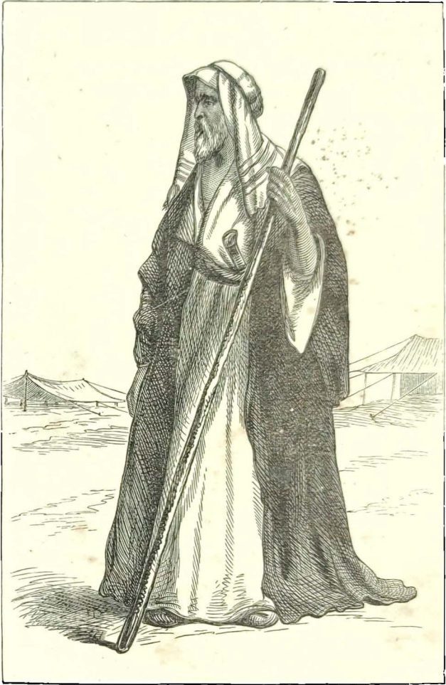
AN ARAB SHEIKH LEANING ON HIS STAFF.