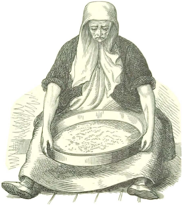
A BETHLEHEM WOMAN SIFTING WHEAT.